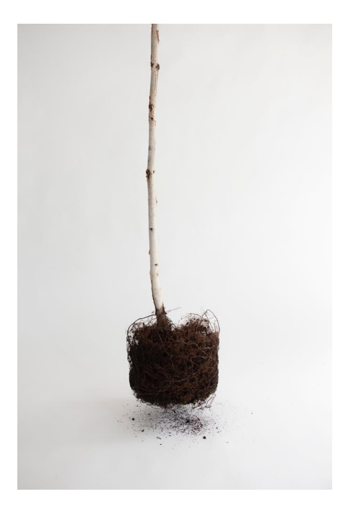
The Past Is A Foreign Country (detail) 2018, 300 x 400 x 300 cm, 20 birch trees, twine, paper