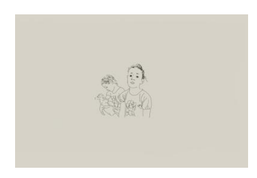
Moments, HD animated drawings (series of five), stills

An attempt to translate terror's destabilizing impact is echoed in Moments , a collaborative project with Syrian journalist Razan Ibraheem. Five animated line drawings, portraits of children traced and removed from their original context, play in a continued loop against a soundtrack of street noise, intermittently punctuated by voices from the actual video footage.